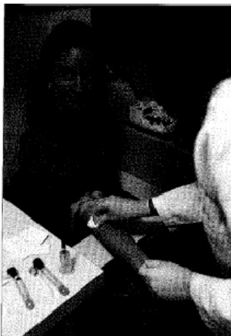
"Success" as a disciple is measured by the ways in which we give.