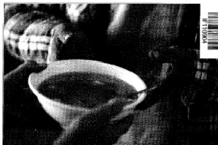
How do you serve the needs of those in your local community? The latest photo

Not only this, we have been shown what true stewardship